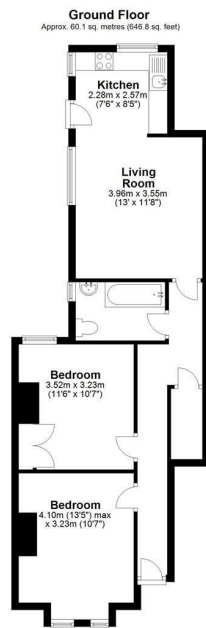
Total area: approx. 60.1 sq. metres (646.8 sq. feet)